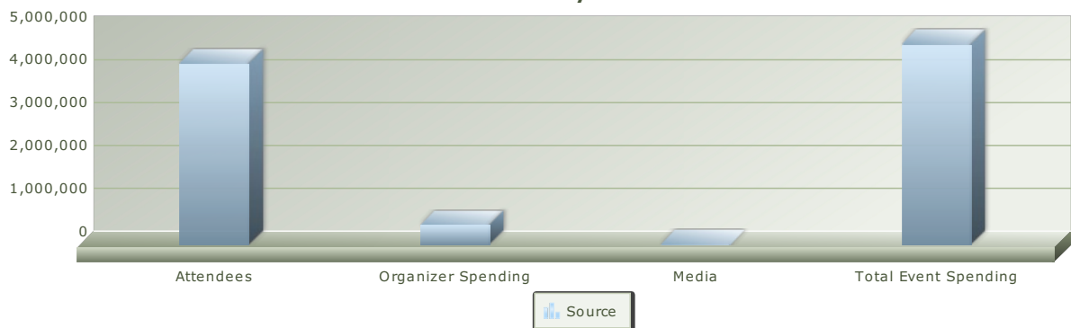
Sales by Source