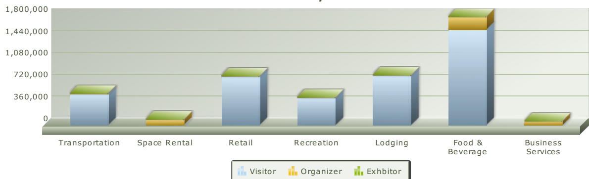
Sales By Sector

* indicates that the calculator's model defaults were used